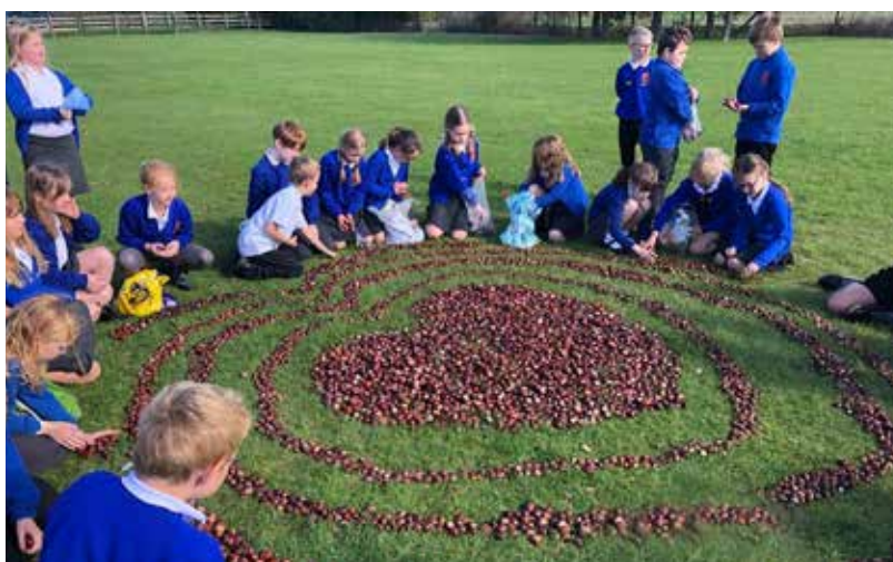
Conkers conquer all... pupils at Patrington celebrate World Mental Health Day