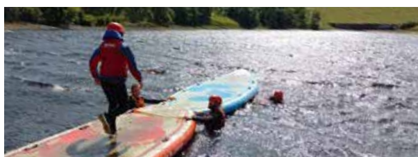
Year 6 pupils at Easington Church of England Primary Academy had a splashing time on their residential.

Adventure and fun was the focus, with Wilderness Outdoor Education, giving the youngsters a taste of independence in the great outdoors.