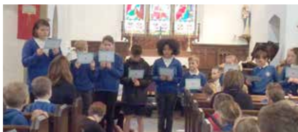
Riston children lead the 150th birthday celebration of the school