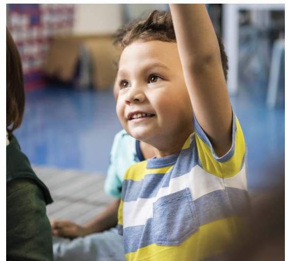
Ebor Academy Trust is part of EborHope Teaching Schools Alliance and administer the Early Excellence courses, which are open to all schools.